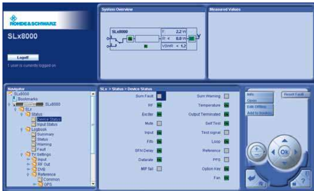
Convenient operation of the R&S®SLx8000 family of UHF/VHF transmitters via a web browser.

The output stages in the transmitters for digital standards are precorrected for all specified frequencies and power levels. After a change in frequency or power, the automatic set&go function loads the corresponding precorrection curve in the background. Manual precorrection is therefore not necessary when a transmitter is put into operation or a when a channel is changed. The available precorrection curves make it possible to reduce the power by as much as 10 dB below the rated power throughout the entire frequency range.